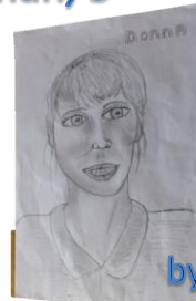
by Rio Rogers, 10