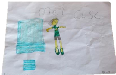
by Georgina Cotgrove, 7