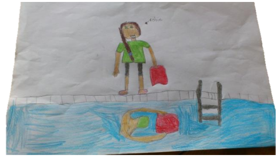
by Lacie-Mai Capon, 8